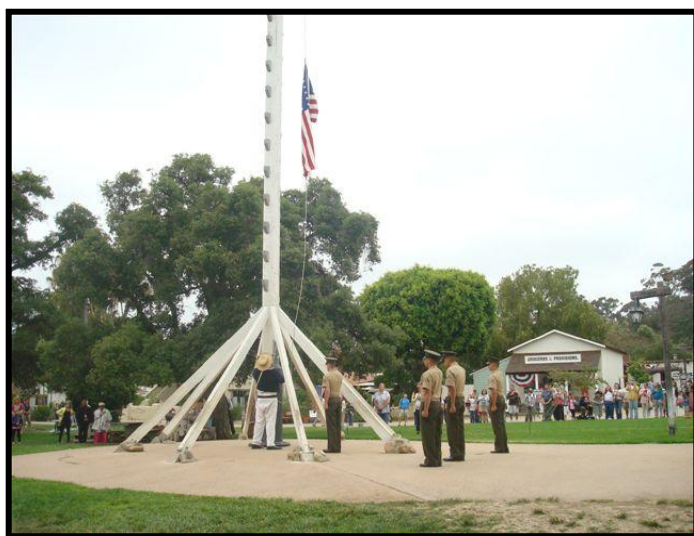
Raising "Old Glory" – July 4, 2010

Overall it was a great day and provided a whole bunch of fun for a whole bunch of people! Thanks to everyone who made this great celebration possible!!!!