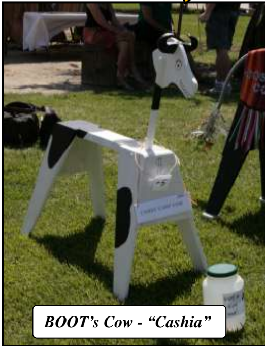
BOOT's Cow - "Cashia"

Business owners, staff, and Boosters of Old Town were asked to create a steer or cow out of a wooden saw horse. On August 27, the participating cattle were “rounded up” and displayed in front of the Robinson Rose building on the plaza. Voting buckets collected the votes that cost $1.00 each. The funds went to Boosters to support the interpretation and education programs in the Park. The Fiesta de Reyes steer was the winner. We hope to have an even larger “round up” next year so start thinking how you can create a memorable bovine!