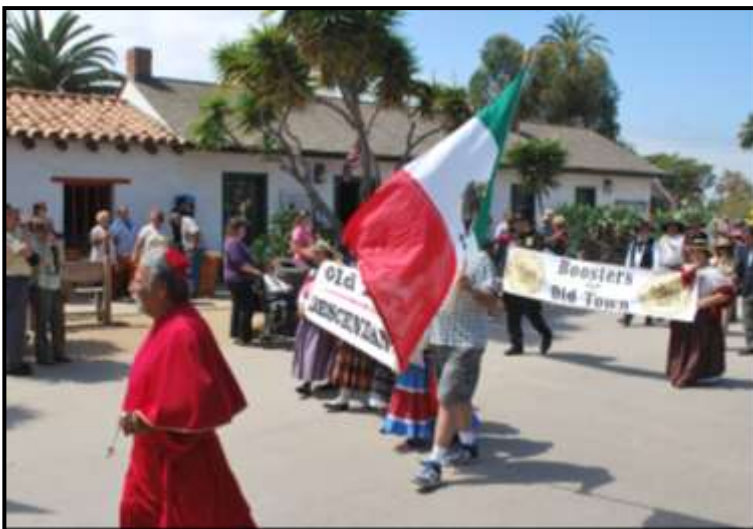
Fiestas Patrias Parade 2011