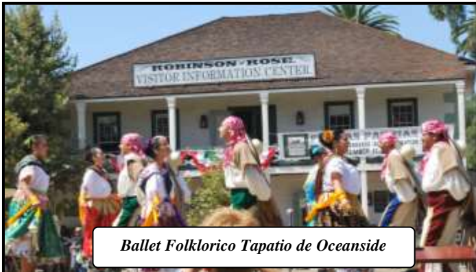
Ballet Folklorico Tapatio de Oceanside

Check Page 5 in this issue, to see the activities in the Park, including "Trick or Treat" for the children.