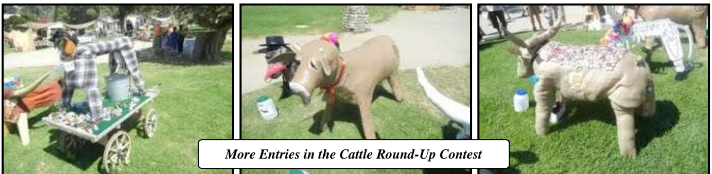
More Entries in the Cattle Round-Up Contest